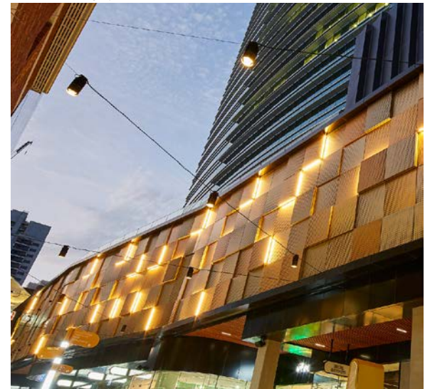
Odessa catenary option