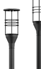
Forrey 16 Ø12.5"