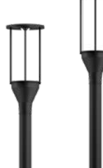
Forrey 15 Ø12.5"