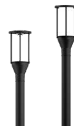
Forrey 13 Ø12.5"