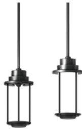
Forrey 31 Ø12.5"/10.5"