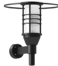
Forrey 36 Ø20"