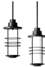
Forrey 32 Ø12.5"/10.5"