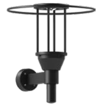
Forrey 33 Ø20"