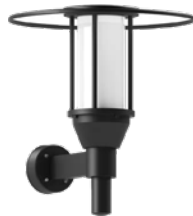
Forrey 35 Ø20"